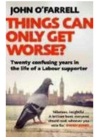
UK Politics 1997-2017 seen from a Labour point of view

It should be treated as 'light reading' i.e. not like a textbook full of facts. They are often telling 'stories' or anecdotes so try to read them like a novel on holiday, or dip in and out of different sections and you will get a sense of the political context of either the USA or the UK. You do not need to make specific notes but should be prepared to share some key things that you have learnt/ insights that it has given you.