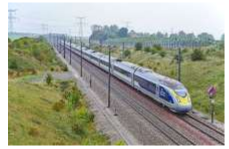
Eurostar to paris

Easyjet and RyanAir fly directly to Bordeaux for Uk urostar trainAirports but I recommend taking the train because it is more relaxing and you get to see the french countryside. You should take the Eurostar from London to Paris then take another train to bordeaux. It is a high speed train with to floors and free wifi and the seats have tables so you can work