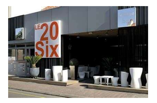
Chez Lili - cafe. It's 5 stars and serves: Breakfast, Brunch, Lunch and drinks. Cuisines: Italian, Cafe.

Cuisines: French, International, European, Contemporary.