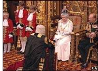
The Queen outlines the legislative programme set by government

There is also limited opportunity to propose new laws through private members' bills, where back-bench MPs try to persuade Parliament to adopt causes close to their own hearts - although these rarely result in anything more than publicity for their causes - or private bills, which tend to relate to a specific organisation or corporation.